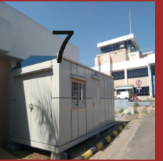
Composite Panel Cabin